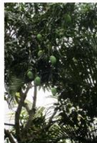
There are many kinds of fruit trees too. These are papaya, starfruit and mango trees.