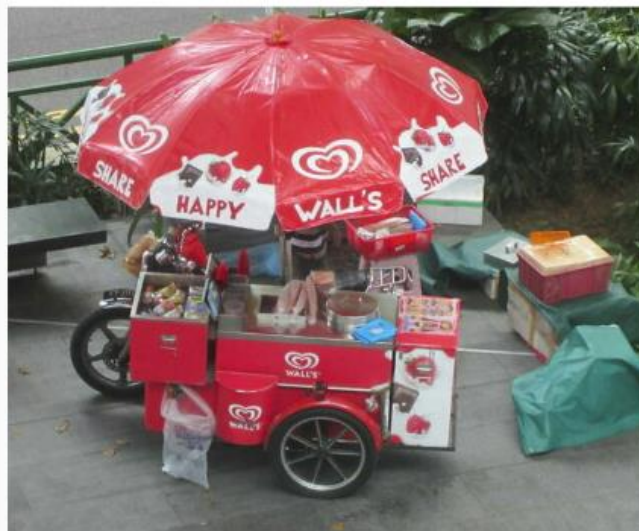
On a hot day, you can buy ice cream from a cart by the road.