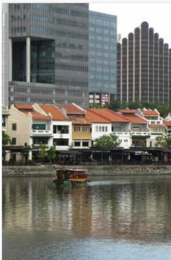
A Trip to Asia Pacific