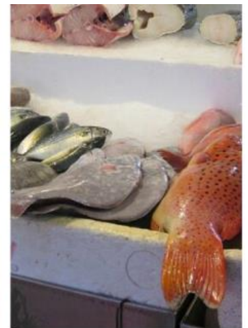
You can buy all kinds of fresh fish too.