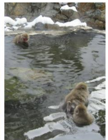
These monkeys live in the snow. They like to sit in hot water.