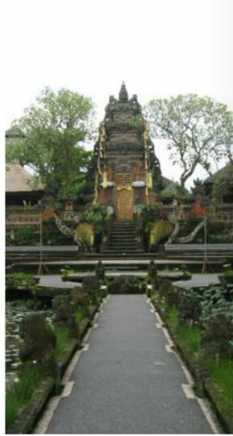
Some buildings are very old.