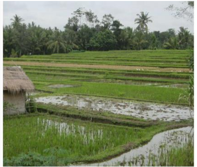
You can go to the padi fields. Padi is the name of rice when it is in the fields.