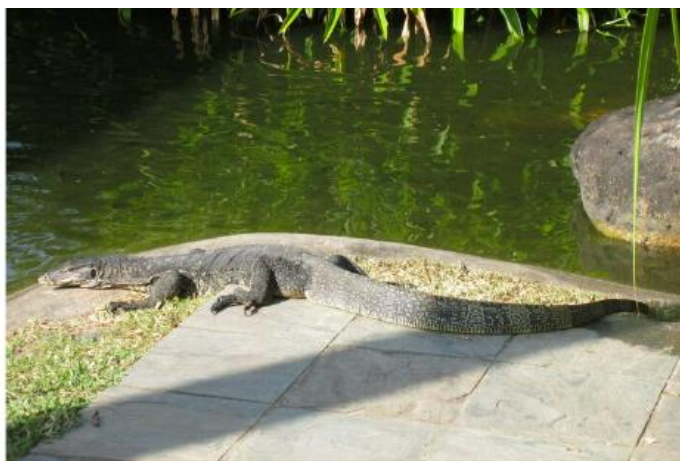
You may see special animals. This is a monitor lizard.