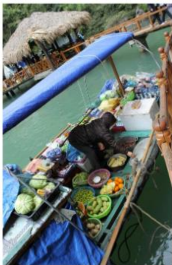
Some people sell food from their boats.