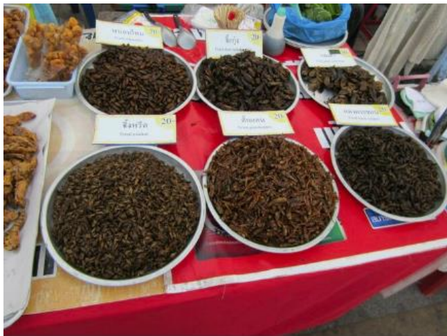
These are special fried snacks. They are bugs.