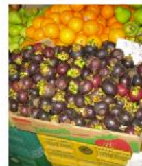
These are some of the fruits and vegetables you can buy.