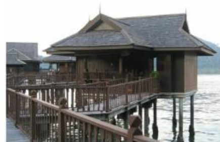
Asia Pacific is a fun place to visit. There are many things to see and do.