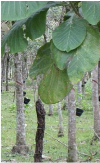
You may see rubber trees. They have rubber sap called latex.