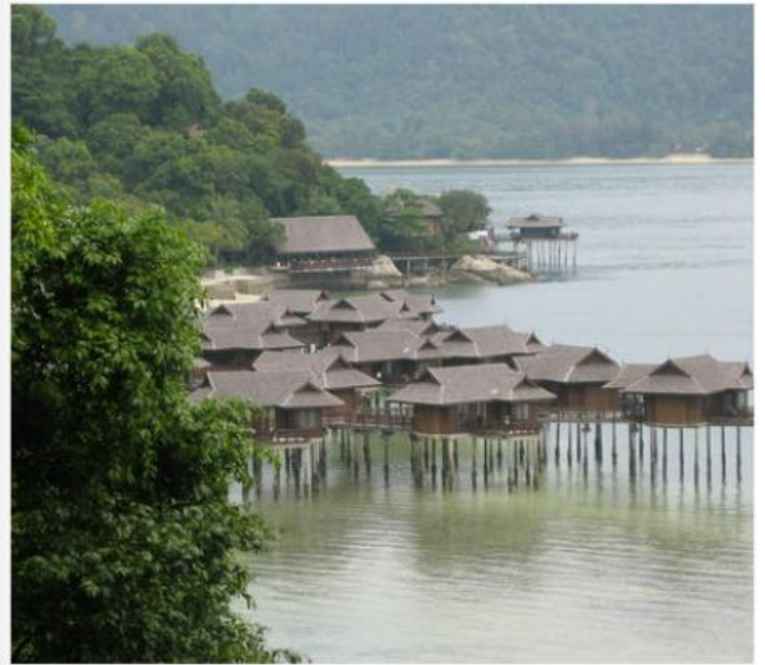
These houses are on the water.