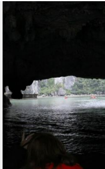
You can take a boat ride to see some caves.