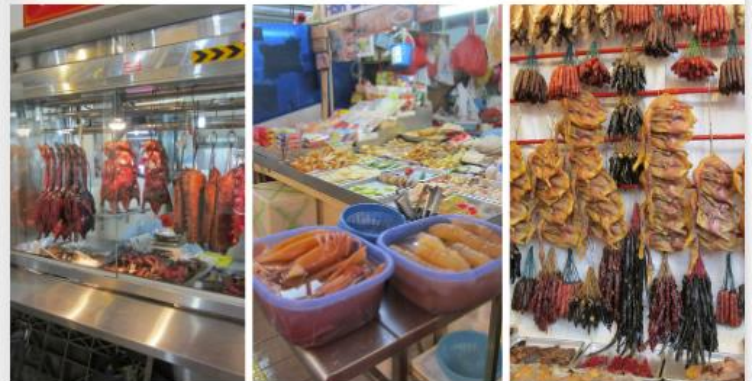
You can go to the market. You can buy many kinds of foods there.