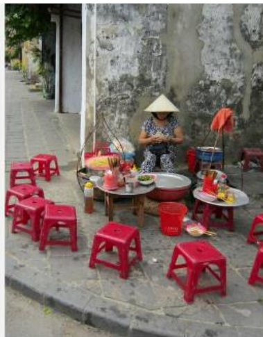
Some people sell food in the streets.