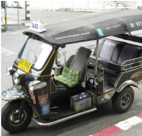
This is a special taxi called a tuk-tuk. You can go lots of places in this.